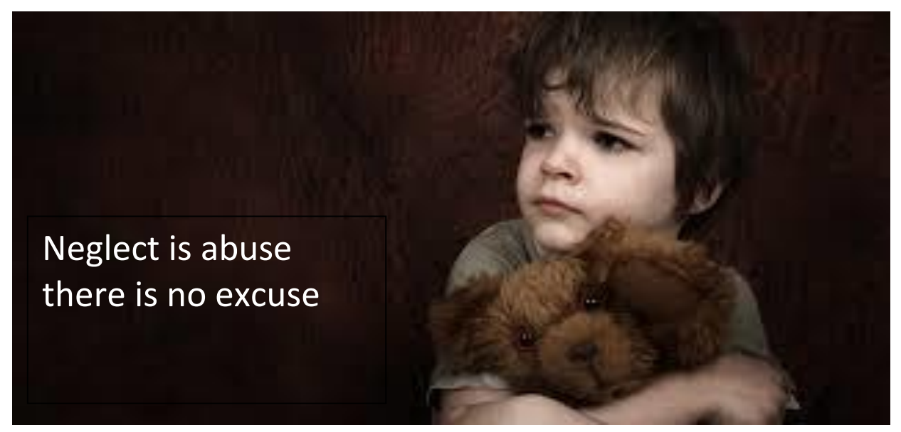
Page 15 of 21

In addition to the Neglect Strategy, South Yorkshire Police have worked jointly with the NSPCC to develop 'Child Matters' training which is aimed at tackling child neglect based on the principles of the GCP2. The training commenced in September 2021, is being delivered to all police officers and is open to multi-agency partners to encourage working together. To date there have been 81 training sessions delivered and a total of 4600 attendees. The bespoke programme will assist and support staff in identifying, intervening and taking appropriate action in cases of child neglect to reduce the risk of babies, children and young people from experiencing further harm.